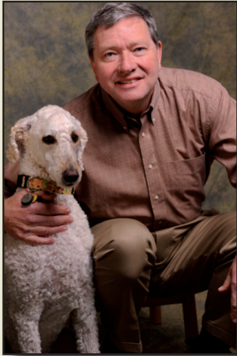
If dogs could vote!

If you agree with my manifesto and believe that my experience is relevant, please give me your vote on election day.