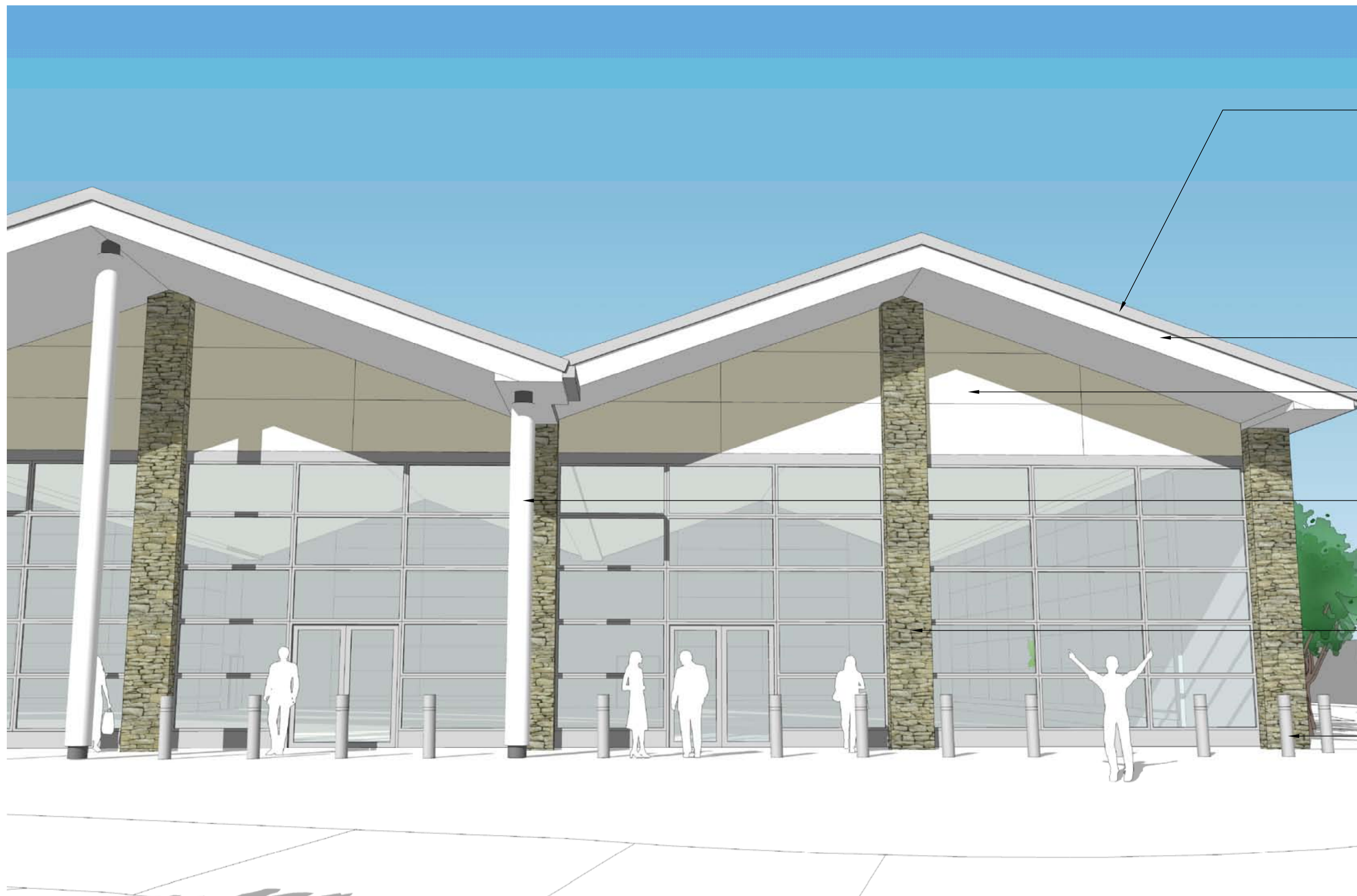
PERSPECTIVE ELEVATION NTS

This drawing is only to the stated scale if it is printed correctly. MFLP cannot accept responsibility for the incorrect scaling of drawings printed by third parties. All dimensions are in mm unless otherwise stated. If this drawing forms part of an application for planning permission on behalf of the applicant named below, it shall not be used for any other purpose without the express permission of Mountford Pigott LLP. This drawing may incorporate information from other professionals. Mountford Pigott LLP cannot accept responsibility for the integrity and accuracy of such information. Any clarification and/or additions that are required pertaining to such information should be sought from the relevant profession or their appointment representative as listed below. LIST OF INFORMANTS: ORDNANCE SURVEY TOPOGRAPHICAL SURVEY LANDSCAPE - ASPECT LANDSCAPE PLANNING HIGHWAYS - SAVELL BIRD & AXON BRIDGE & RETAINING WALLS - BURO HAPPOLD REVISIONS: ISSUED FOR PLANNING DATE: 08.12.10 DRN: CB REV: A