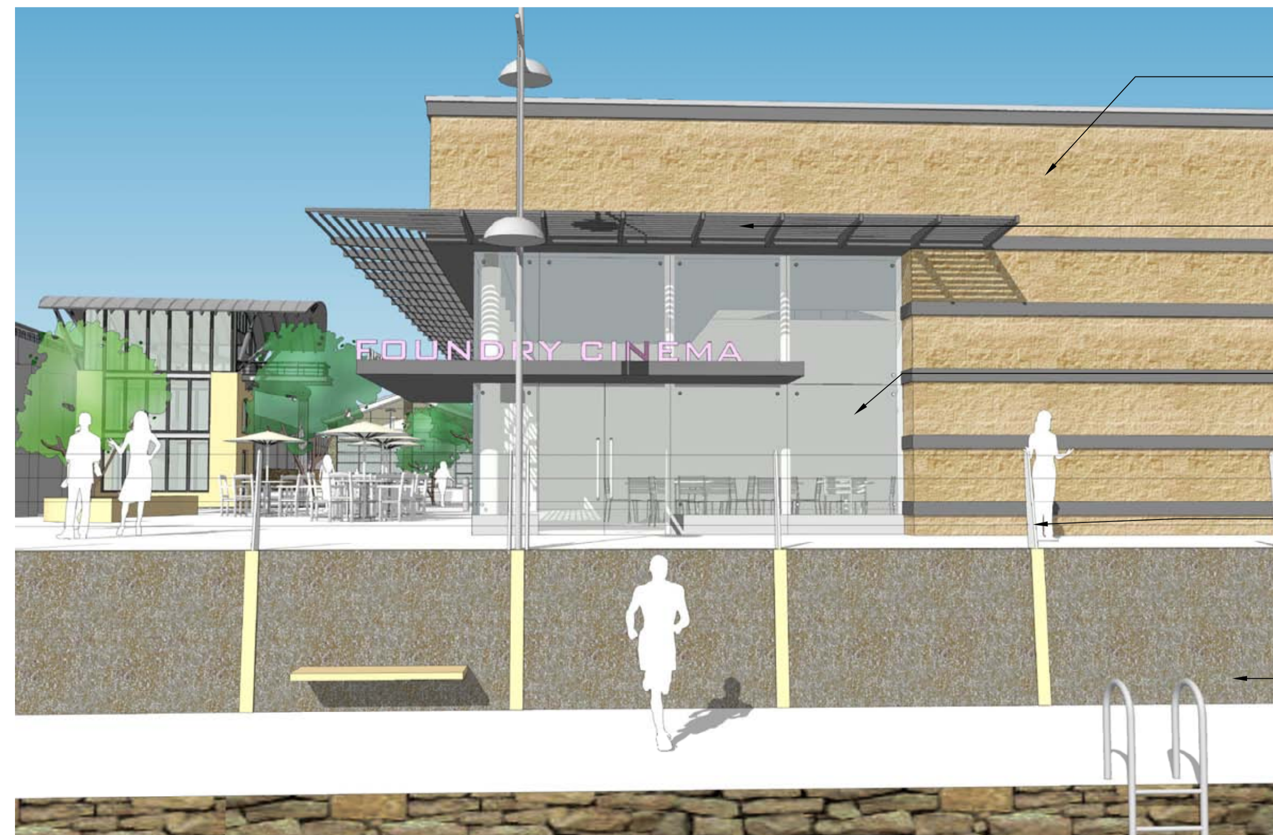
PERSPECTIVE ELEVATION nts

This drawing is only to the stated scale if it is printed correctly. MFLP cannot accept responsibility for the incorrect scaling of drawings printed by third parties. All dimensions are in mm unless otherwise stated. If this drawing forms part of an application for planning permission on behalf of the applicant named below, it shall not be used for any other purpose without the express permission of Mountford Pigott LLP. This drawing may incorporate information from other professionals. Mountford Pigott LLP cannot accept responsibility for the integrity and accuracy of such information. Any clarification and/or additions that are required appertaining to such information should be sought from the relevant profession or their appointment representative as listed below. LIST OF INFORMANTS: ORDNANCE SURVEY TOPOGRAPHICAL SURVEY LANDSCAPE - ASPECT LANDSCAPE PLANNING HIGHWAYS - SAVELL BIRD & AXON BRIDGE & RETAINING WALLS - BURO HAPPOLD REVISIONS ISSUED FOR PLANNING DATE: 08.12.10 DRN: CB REV: A