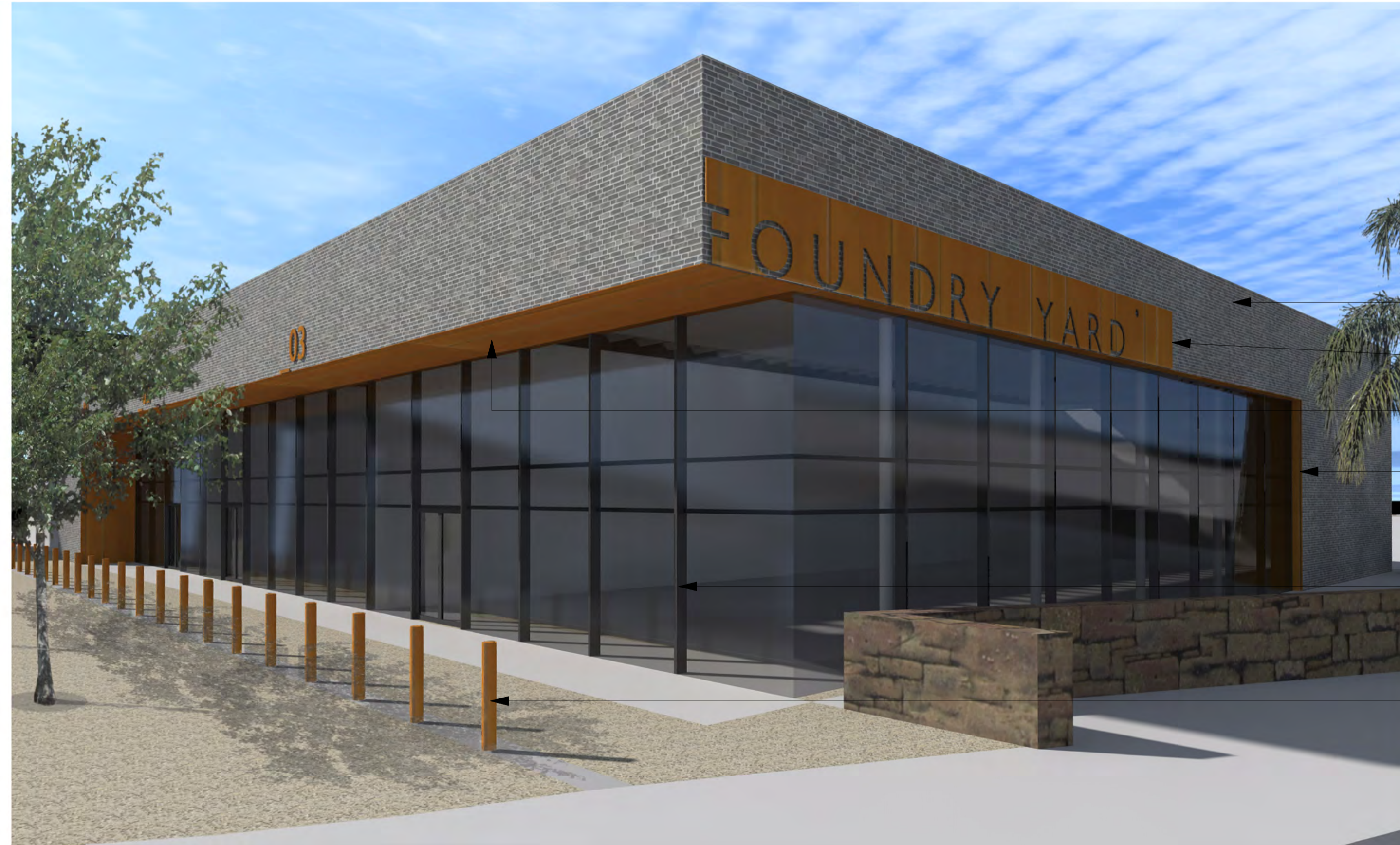
01 PROPOSED ELEVATION VIEW